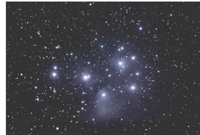
The Pleiades (M45) imaged during Okie-Tex 2004

park also encompasses Black Mesa itself which is a nature preserve.